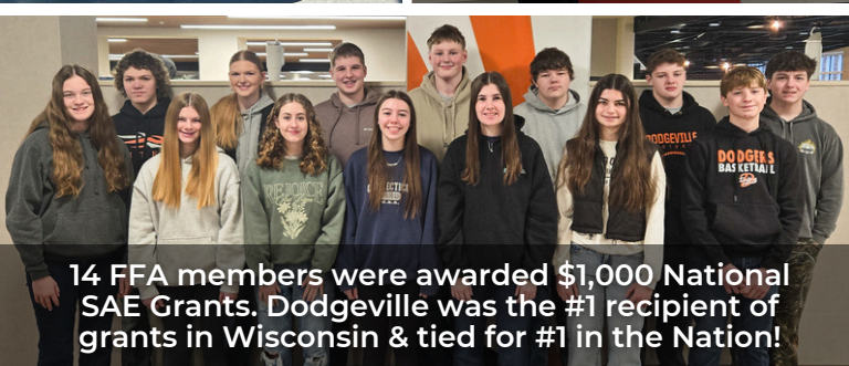
14 FFA members were awarded $1,000 National SAE Grants. Dodgeville was the #1 recipient of grants in Wisconsin & tied for #1 in the Nation!